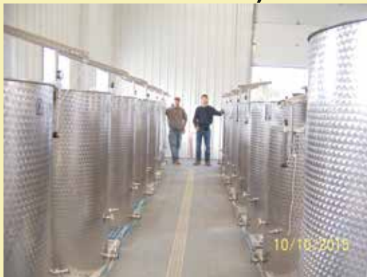
Crafted on site!

Chardonnay Noiret Cabernet Franc Tank 13 Riesling Traminette Vignoles LeCrescent Valvin Muscat Pinkaliciouz Rebel Red Blackberry