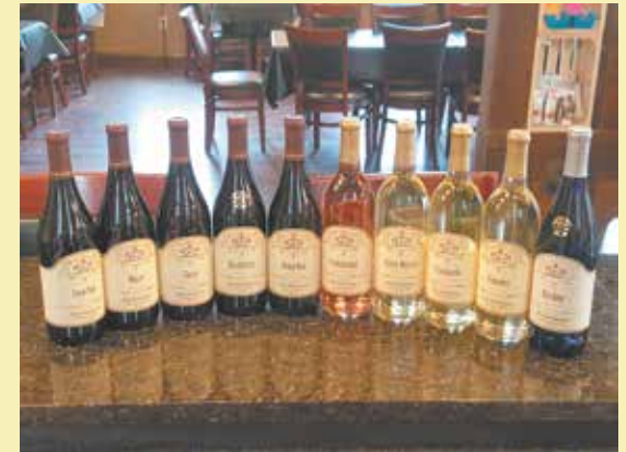
Enjoy the large selection of wines ranging from Dry to Sweet.