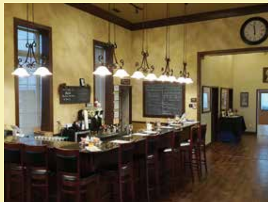
Experience the up-scale tasting room